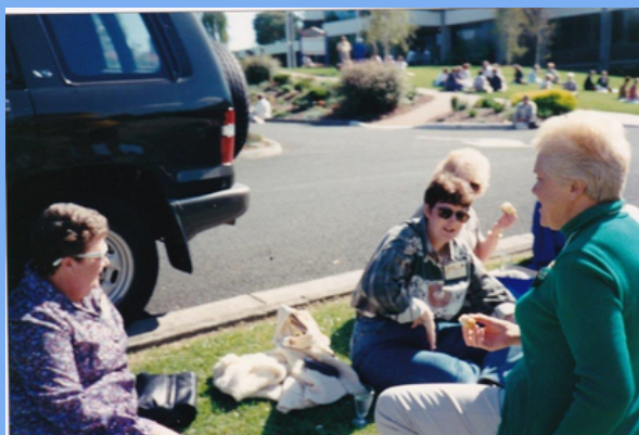
Having lunch on the grass at a Seminar in Ringwood.